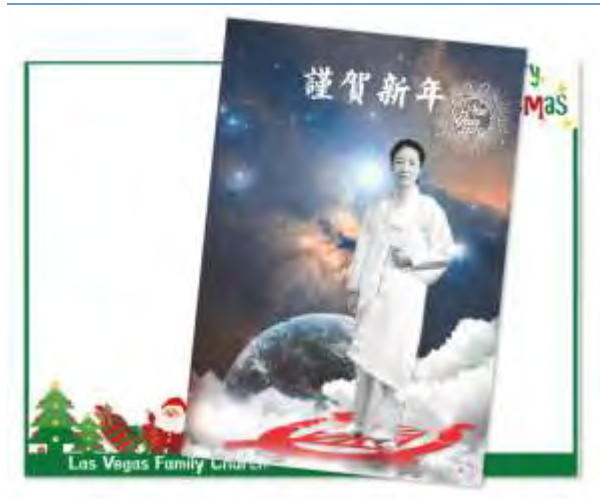
Please write your message for True Mother on Christmas card after Sunday service.